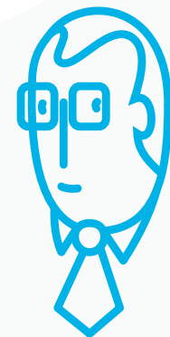
Informed & connected policy makers